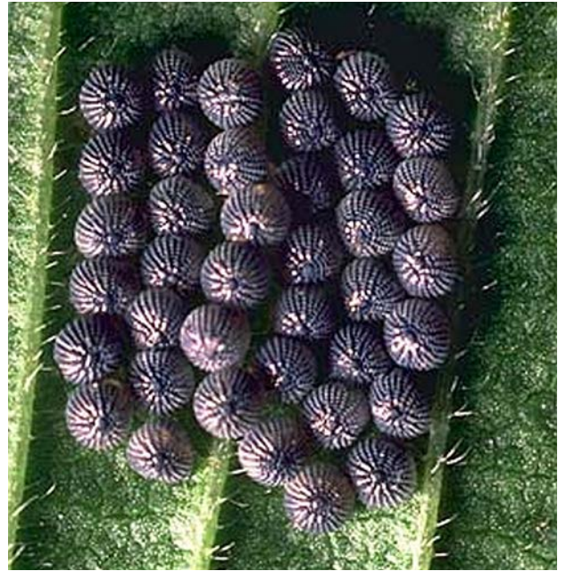
Whose Eggs Are These? • Level G